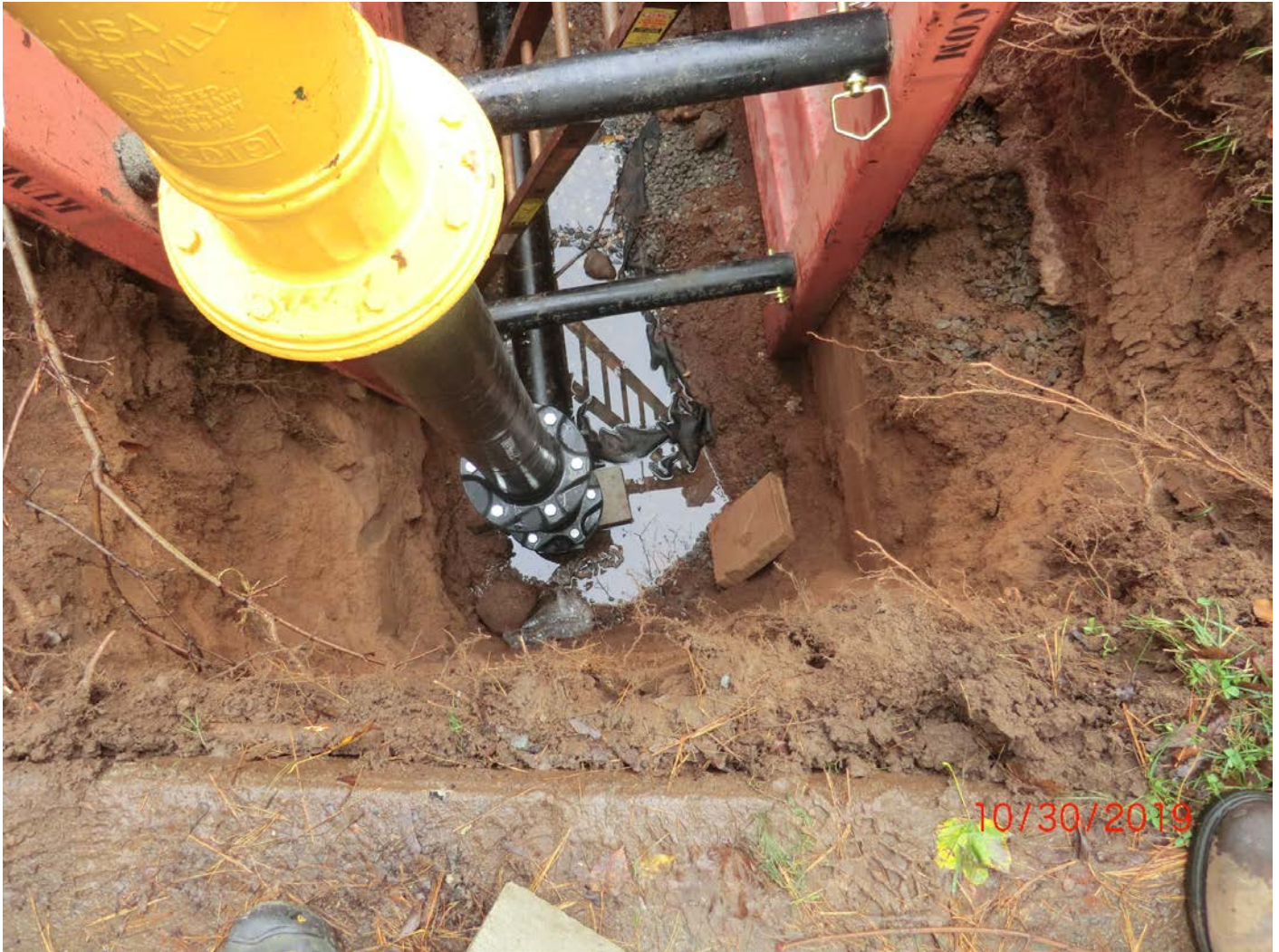
Figure 8 – Block support under hydrant elbow. Thrust block not yet in place.

Date: October 30, 2019 Day of Week: Wednesday Report No: 24 Page: 10 of 15