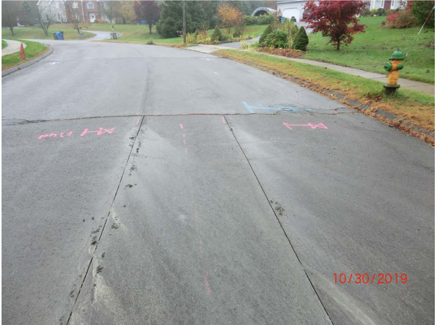
Figure 9 – Facing south. Upper end of saw cut to existing hydrant on Watch Hill.