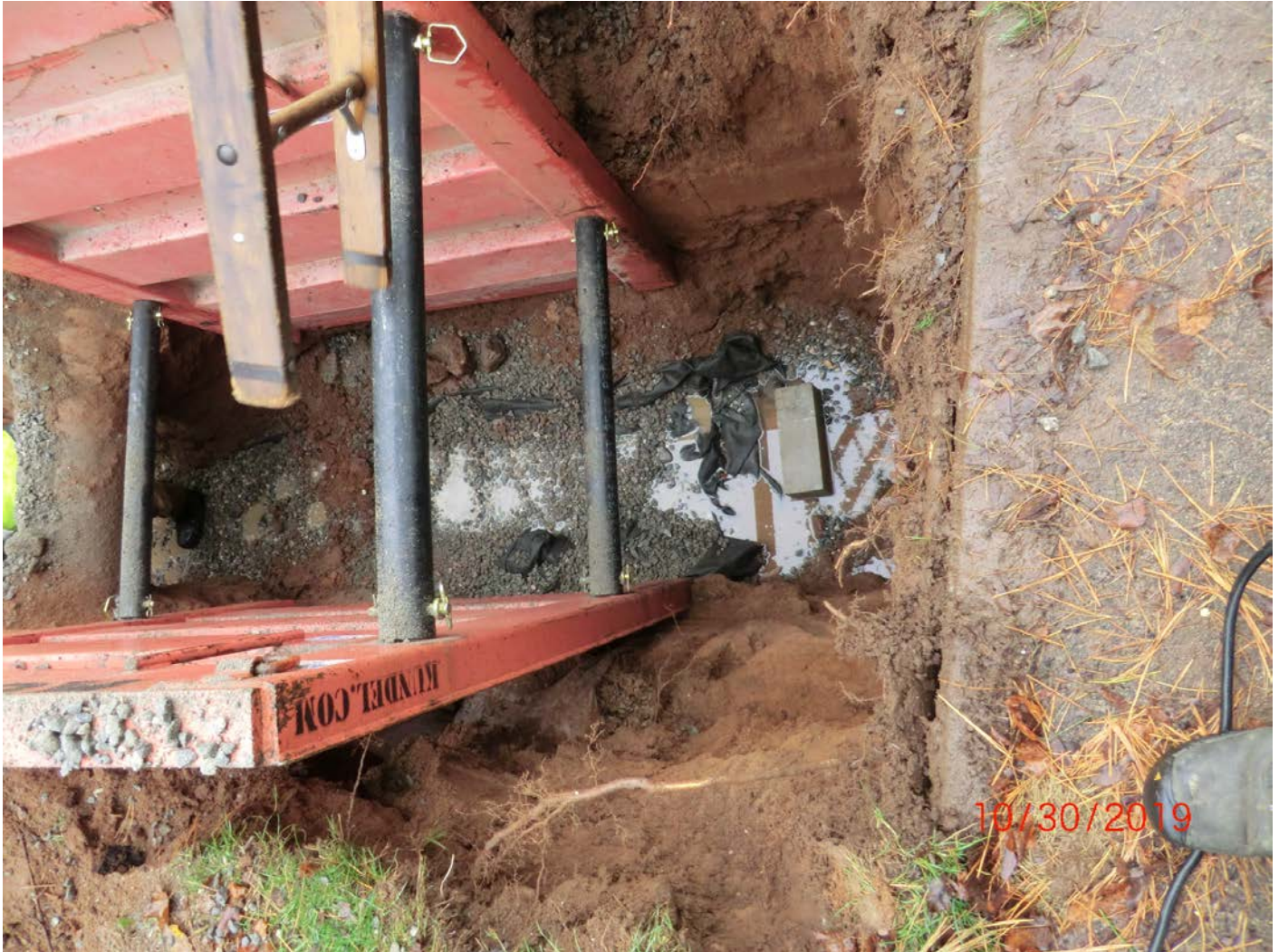
Figure 3 – Pit for hydrant installation at Sta. 51+44.83 (corrected distance). Location is at bottom of Talcott Ridge by Main Street, where water table was encountered due to lower elevation of the area.

Date: October 30, 2019 Day of Week: Wednesday Report No: 24 Page: 5 of 15