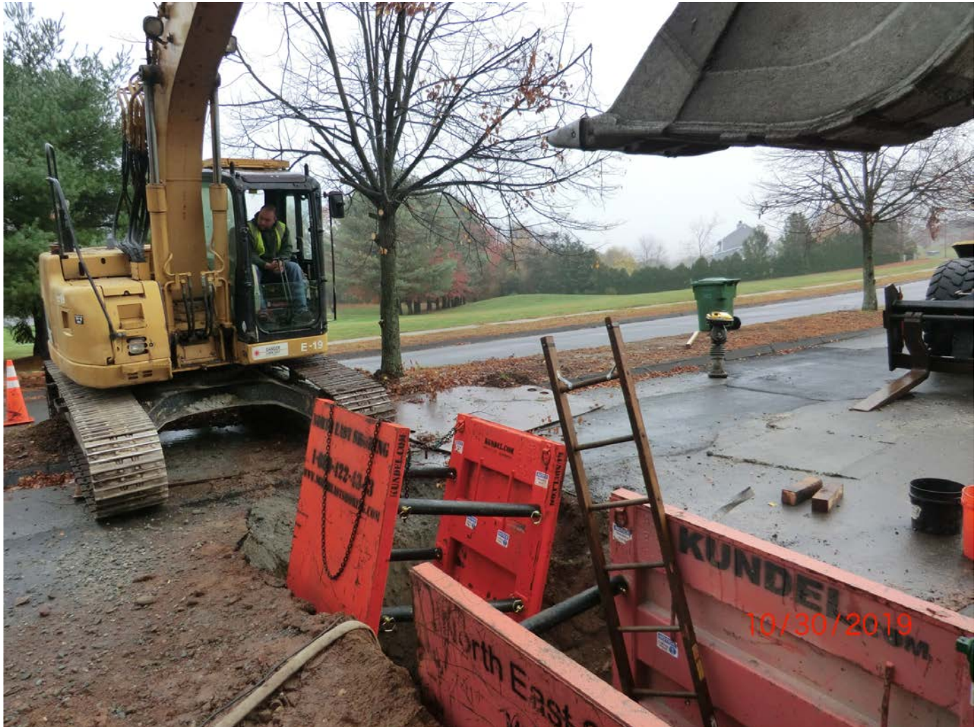
Figure 6 – In order to excavate the trench, it was necessary to cut some limbs of the tree on the island. Center of picture.

Date: October 30, 2019 Day of Week: Wednesday Report No: 24 Page: 8 of 15