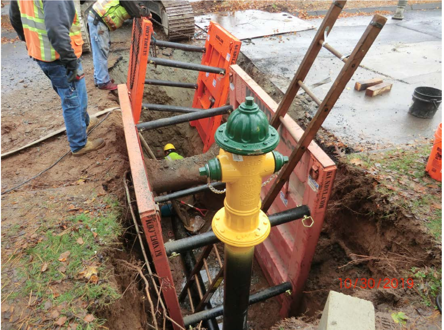
Figure 7 – Finalizing restraint connection to gate valve.

Date: October 30, 2019 Day of Week: Wednesday Report No: 24 Page: 9 of 15