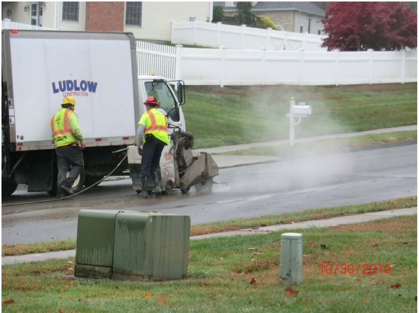
Figure 2 – Facing southeast – saw cutting in process.