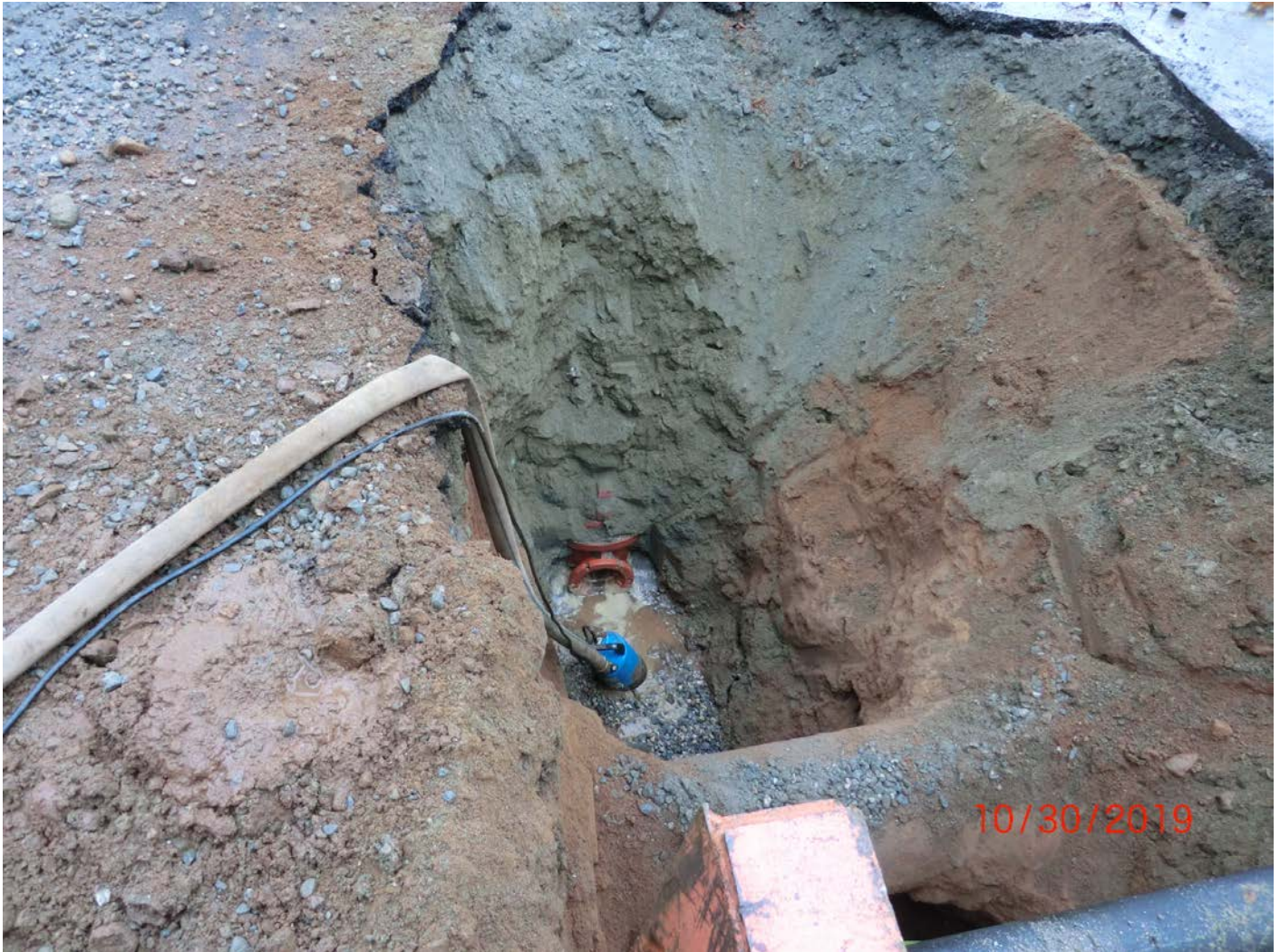
Figure 4 – Hydrant 6” Gate valve assembly hookup. Sump used to dewater during installation. Note the installation crosses under an 18” drain line.

Date: October 30, 2019 Day of Week: Wednesday Report No: 24 Page: 6 of 15