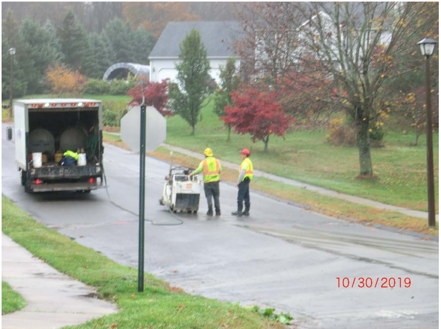
Figure 1 – Facing southwest, saw cutting Watch Hill Drive from first intersection with Talcott Ridge.

Date: October 30, 2019 Day of Week: Wednesday Report No: 24 Page: 3 of 15