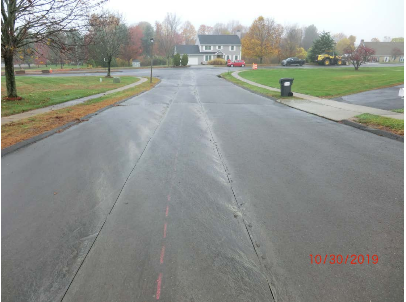
Figure 10 – Facing north. Road cut down to hydrant Tee on Talcott Ridge. Main Street can be seen in the upper left portion of the picture.