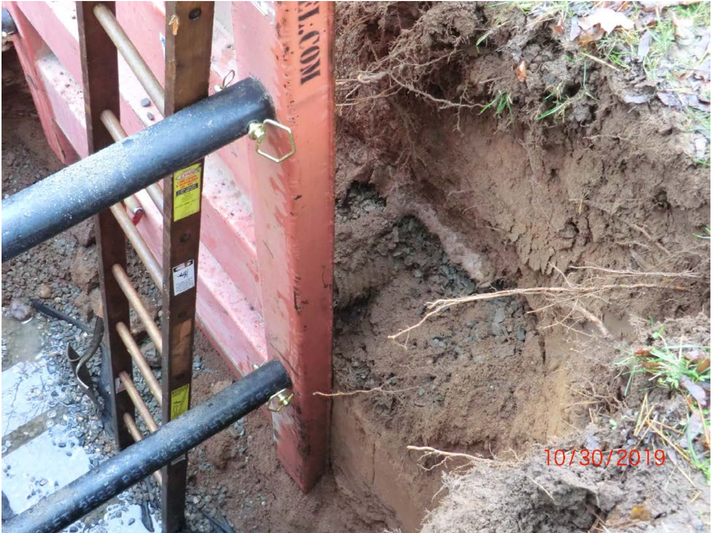
Figure 5 – Drain pipe in the curb cut, center of picture to right of road box. The cut out section was later replaced.

Date: October 30, 2019 Day of Week: Wednesday Report No: 24 Page: 7 of 15