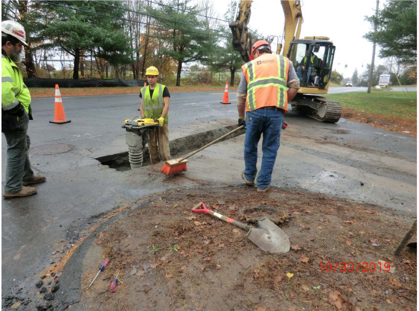
Figure 12 – Looking northwest. Backfilling test pit trench at the foot of Talcott Ridge and Main Street. Connections were determined to be restrained.

Date: October 30, 2019 Day of Week: Wednesday Report No: 24 Page: 14 of 15