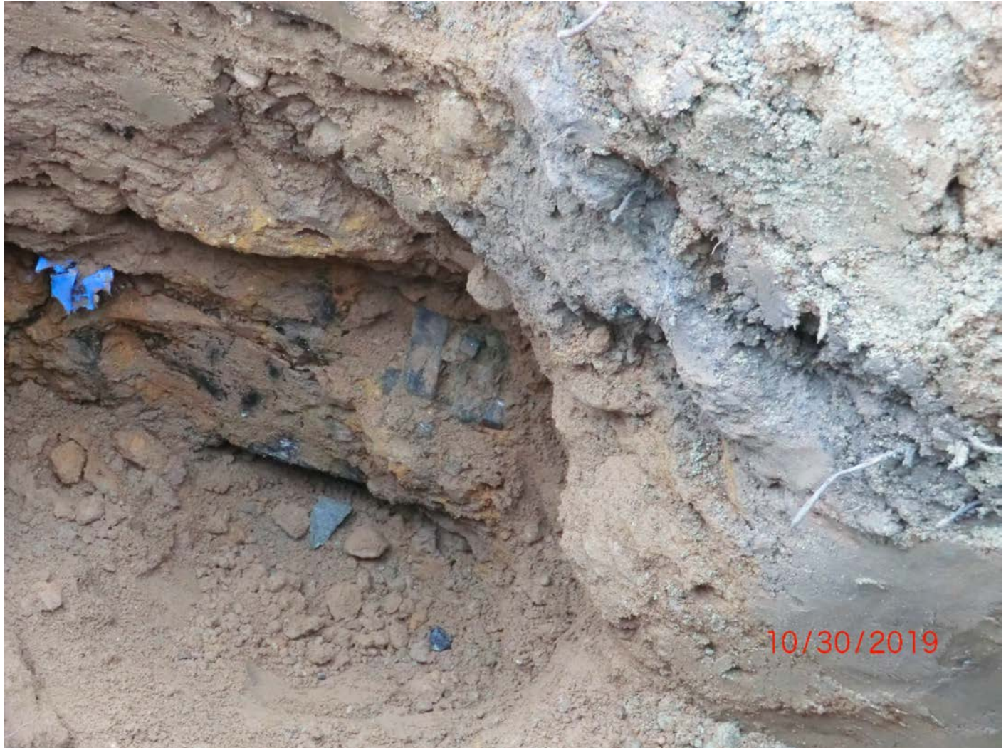
Figure 11 – One of two restrained connections in existing water line at Talcott and Main.